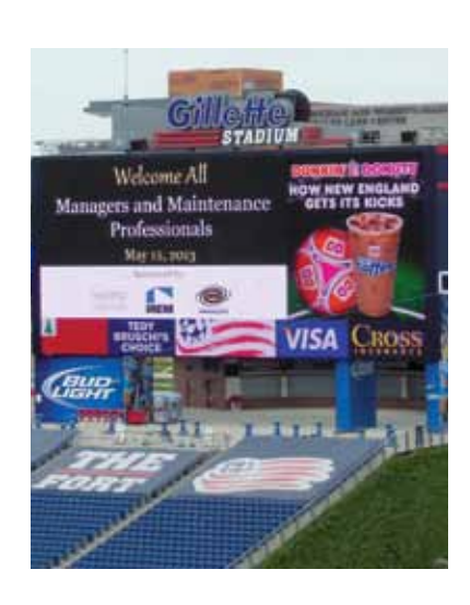
See page 12 for more photos of the event.

Sponsors Needed for NEAHMA's Annual Conference & Trade Show in October! Go to www.neahma.org.