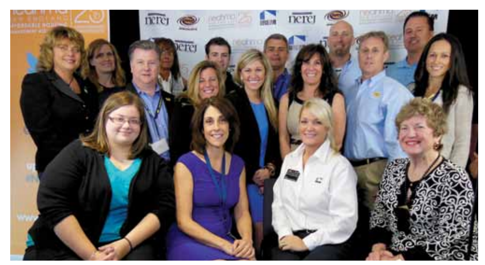
Participants from NEAHMA, ARS Restorations and the Institute for Real Estate Management (IREM) at the one-day training.